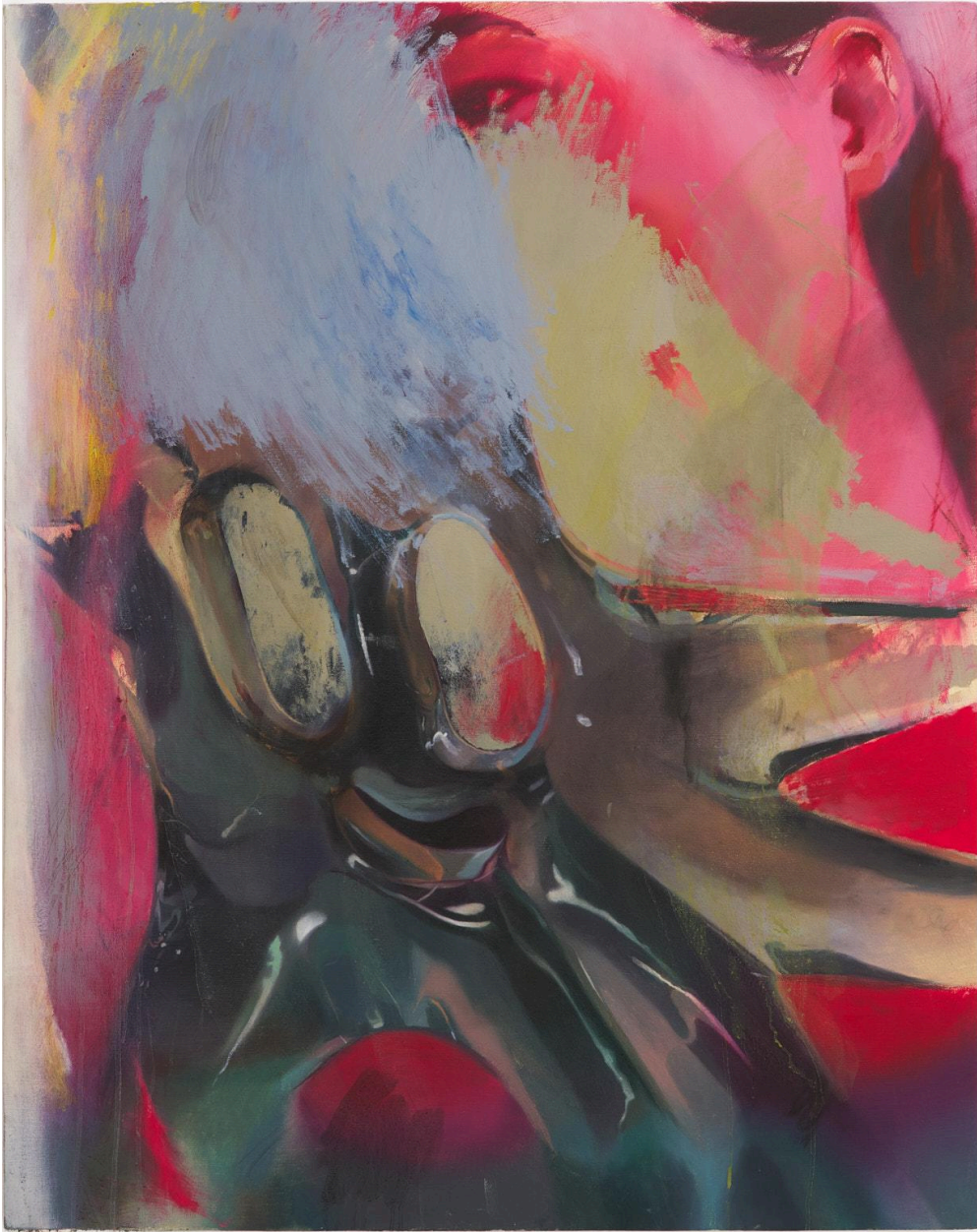
Crystal Visions 100x 80cm, Oil on Canvas, 2024