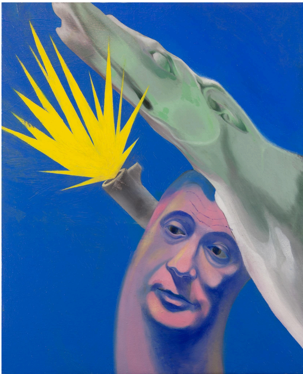
Les Chiens de Garde 39x 46cm, Oil on Canvas, 2024